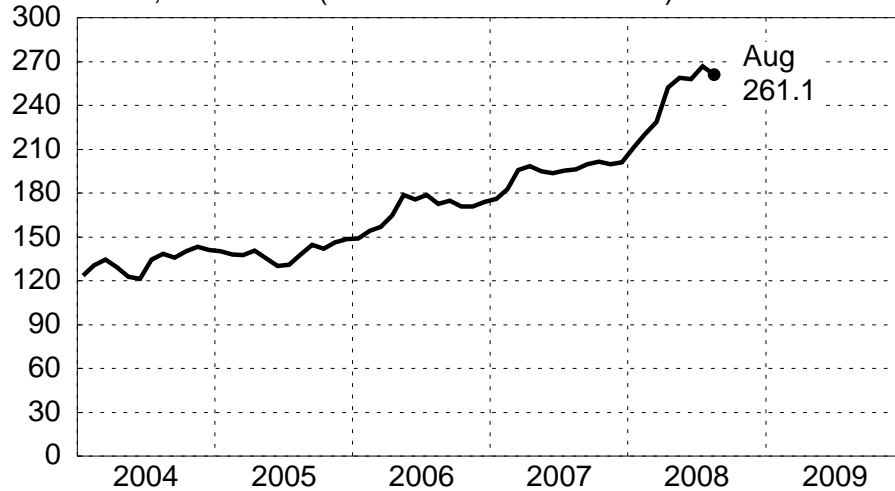
U.S. Producer Prices for Raw Materials Index, 2000=100 (Bureau of Labor Statistics)