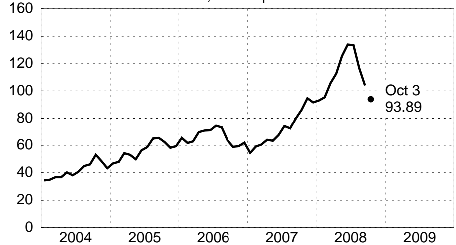
U.S. Spot Crude Petroleum Price West Texas Intermediate, dollars per barrel