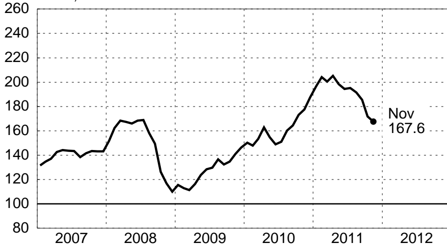
IMF Commodity Price Index (Excluding Fuels) Index, 2000=100