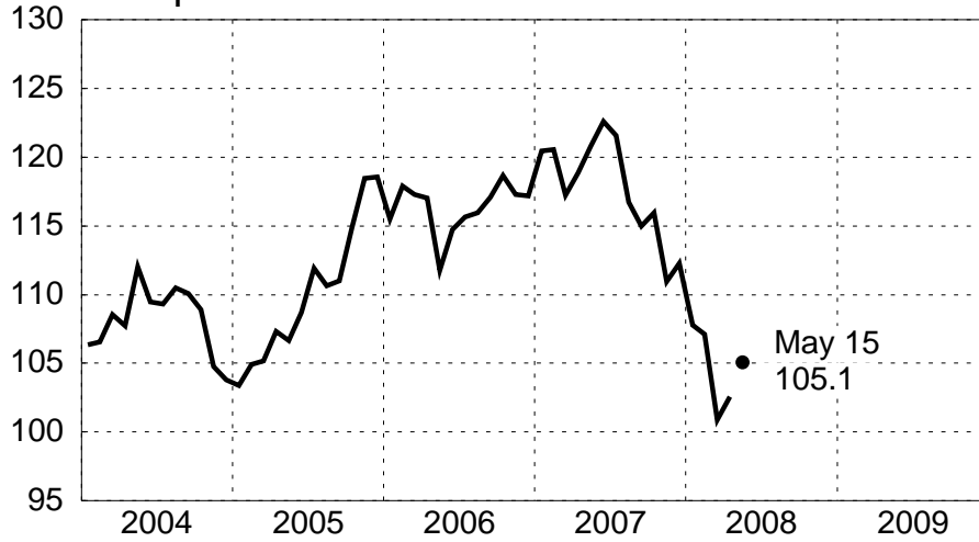
Yen per Dollar